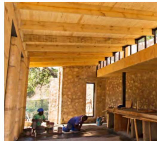
The floors are comprised of tightly compacted earth with a veneer of lime/cement, further reducing the carbon footprint of the building.

We are excited to share with you the progress of the new facility. Creating an inspirational and sustainable learning space in Skukuza enhances science and learning opportunities while showcasing the low impact in architectural design and construction materials to reduce our environmental footprint in all aspects of daily living.