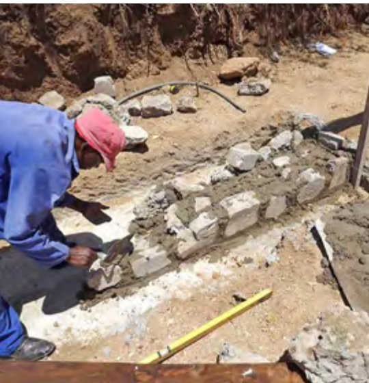
The initial walls were built using recycled concrete slabs rather than using new bricks. SANParks (South African National Parks) engineers chopped up the old helicopter landing pad/parking lot on the site and produced chunks which were used for the project.