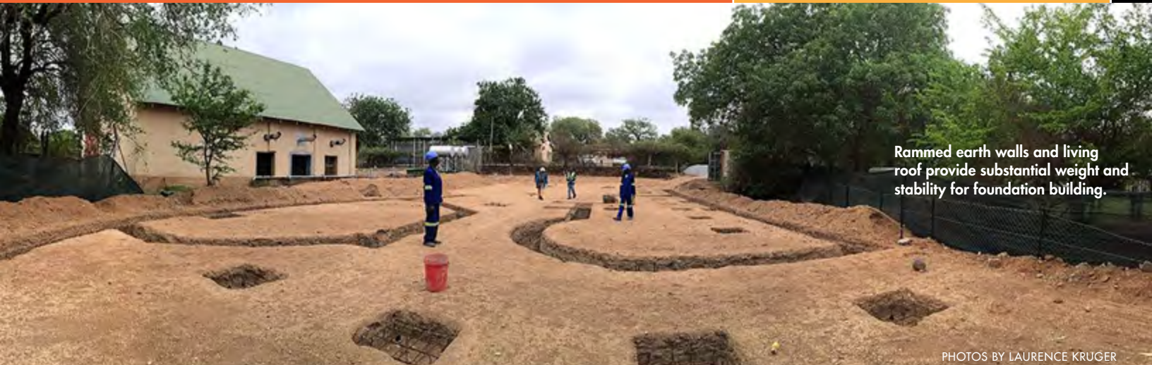
Rammed earth walls and living roof provide substantial weight and stability for foundation building.