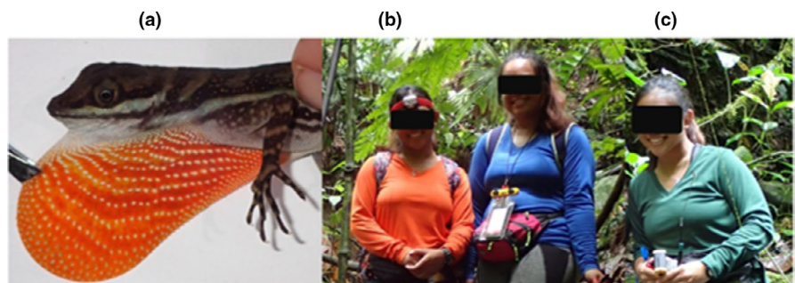
FIGURE 1 Photographic mosaic showing the orange coloration of the male water anole dewlap (a) along with our three shirt colors (orange: b, blue: b, and green: c). Photographs of researchers wearing the shirts were taken in the field, but during a time when they were collecting data for a separate study. Faces have been obscured for privacy

We measured reflectance spectra of the shirts using a spectrophotometer (AvaSpec-Mini2048CL, Avantes Inc.) with an Avalight-XE xenon light source emitting in the range 190–1000 nm. Shirt spectra were taken relative to a white reflectance standard and were then computed with AvaSoft-Full software (Avantes). We calculated hue, brightness, and intensity of color (Montgomerie, 2006) using the pavo package in R (Maia, Eliason, Bitton, Doucet, & Shawkey, 2013). Orange was the brightest and had the highest intensity compared with blue or green (Table 1). Previous