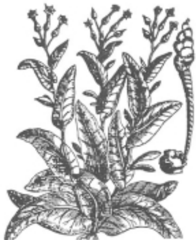
Fanciful Cigar, from l'Obel's NOVA STIRPIUM, Antwerp, 1576

But what about the use by Amerindians? Some groups use tobacco in rituals, smoking fat cigars as long as 100 cm (39") that require special supports. Others chew it or take it as snuff, individually or blown into one's nasal passages by others. Still, a paste obtained from the slow decoction of tobacco, called ambil in Amazonia, is rubbed onto the oral mucosa for rapid absorption, an early version of transdermal administration of a chemical. Tobacco juice, a potent potion, is drunk in rites of passage from puberty to manhood or the initiation of shaman's apprentices, the effect so powerful that it is described as "dying" and repeated many times during the rituals. One less known method of nicotine intake is by enema. You may be interested to learn that the South American Indians invented a syringe made of the hollow, long bone of a bird or a cane provided with a rubber bulb to apply enemas of various