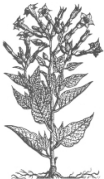
Lance Leaved Petum, from l'Ecluse's HISTO MEDICINAL, Antwerp, 1579

Some of you may have noticed that the last issue of AMIGOS did not include this section. The writer was on a holiday or, rather, suffered from a severe case of writer's block.