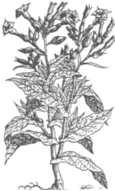
Broad Leaved Petum, from l'Ecluse's HISTO MEDICINAL, Antwerp, 1579

smokes, which are some dry herbs put in a certain leaf, dry also after the fashion of a musket (squib, or tube), lit at one end and at the other they chew or suck and take in with their breath that smoke which dulls their flesh and as it were intoxicates and so they say that they do not feel weariness. Those muskets, they call tobacos.” This is the account of tobacco smoking as recounted by Las Casas in 1527, freely embellishing upon the Admiral’s Journal.