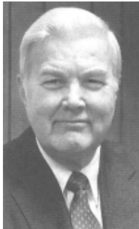
Varro E. Tyler

I therefore made a prediction to the assembled audience that when cures for the various types of cancer were discovered, drugs from plants would play a very important role in such treatment. My bold statement was greeted by considerable