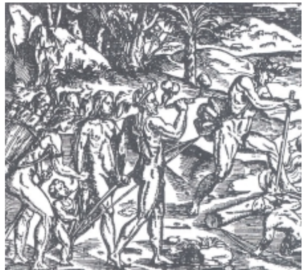
Smoking Indian, from Thevet's SINGULARITEZ, Paris, 1558

Tobacco was planted as a curious and wonderful medicinal plant, used for the bites of animals, headaches, colds, asthma, bruises, rheumatism, ulcers, apoplexy and even the plague. Herbals abound with the almost miraculous properties of Nicotiana , variously mentioned as “herba panacea,” cure-all herb, “herba sancta,” holy herb, “san sancta indorum”