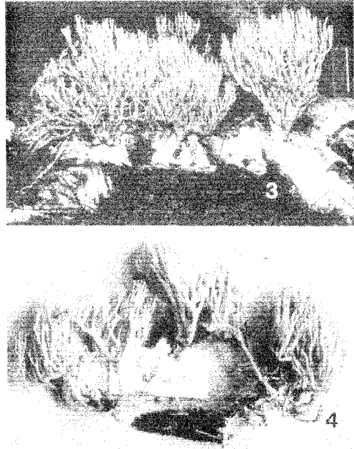
Figs. 3, 4. Basidiomata of Lentaria surculus variant A. Fig. 3. Standard bar = 25 mm. Fig. 4. Paper tag = 25 mm.

Subiculum a felty mat involving slender rhizomorphs within the substratum, extensive to not so, off-white. Stipe base off-white to "cinnamon buff; 6B4." Branches and apices more delicately dissected than in other forms; lower and middle branches "cinnamon;" 6B5. Apices elongate awl-shaped," pale pinkish cinnamon;" 6A2. Hymenium often unilateral, with off-white sterile surface decurrent from axils; axils lunate below, narrowly rounded above; branches in up to six ranks, terete to flattened below, terete above, sympodial to dichotomous throughout. Odor none. Taste distinctly bitter.