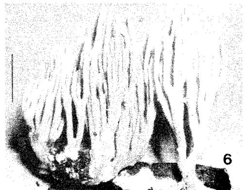
Fig. 6. Basidiomata of Lentaria surculus variant B. Standard bar = 25 mm.

Basidiomata up to 10.5 X 5 cm, branched repeatedly, arbuscular. Stipe up to 3 X 1.2 cm, arising from a subicular mat, single or rarely