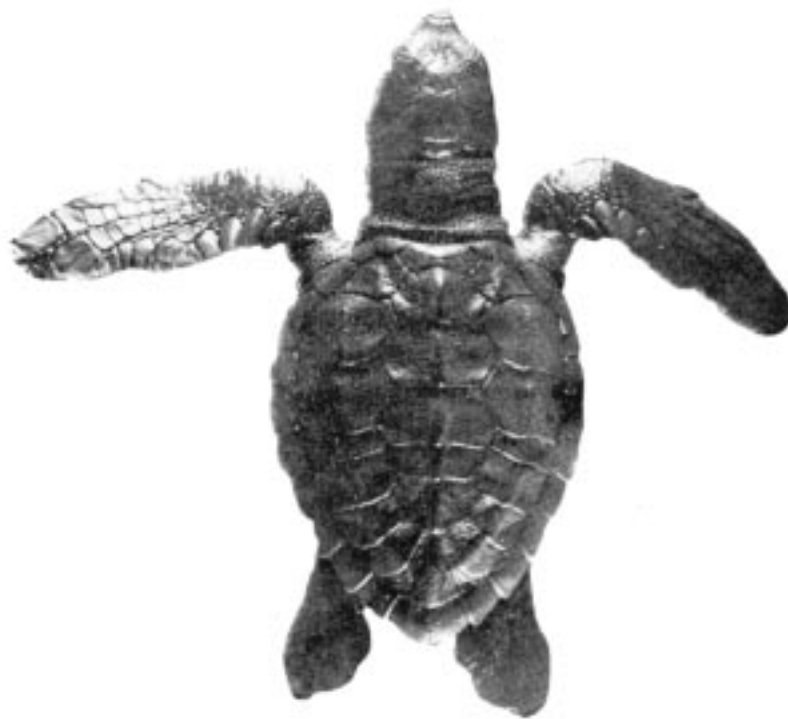
Fig. 1: Lepidochelys olivacea (hatchling) from Dakar with a 7-7 lateral laminal count. The character involved in the diagnostic separation of kempfi and olivacea appears to be fundamentally a tendency in olivacea to revert to a (presumably primitive) many-scaled condition. In the present specimen laterals 4 and 5 seem to have been formed by the splitting of lateral 4 as seen in kempfi , but the possibility that two scales, from two separate embryonic elements, have been squeezed into the place of one cannot be excluded.