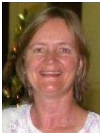
Director of Education