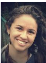
Undergraduate Program Coordinator